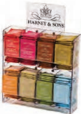
91009 Teabag Lucite Rack