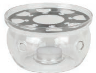
Glass Warmer Warmer 00187