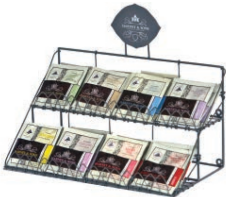
91005 Wrapped Sachet Wire Rack