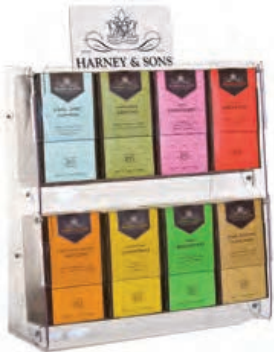
91007 Premium Teabag Lucite Rack