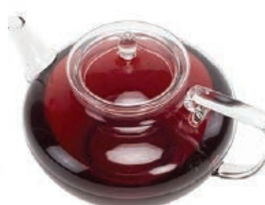
Glass Teapot Large 36 oz. 80076