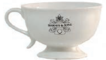
Harney & Sons Cup 04191