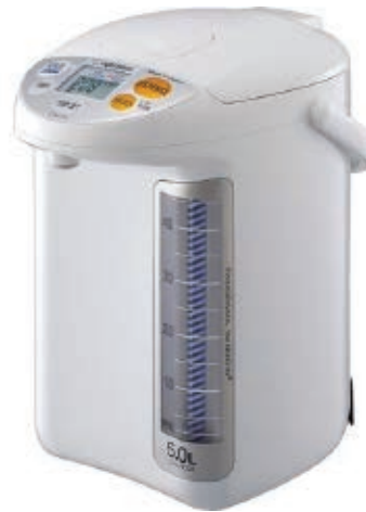
Zojirushi 5 L Hot Water Pot 00325