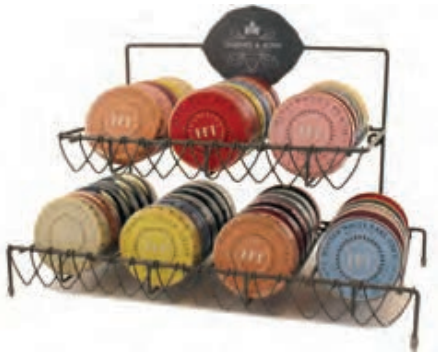
91006 Tagalong Wire Rack