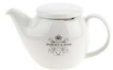
Harney & Sons Teapot 16oz with filter 00262 16oz without filter 00261