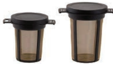
Harney & Sons Teapot 16oz with filter 00262 16oz without filter 00261