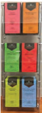
91012 Premium Teabag Lucite Rack (6)