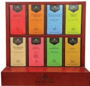
91011 Premium Teabag Wooden Rack