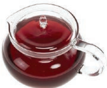
Glass Teapot Small 14oz. 80067