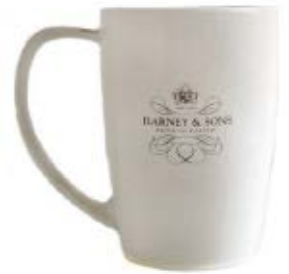
Harney & Sons Mug 00263