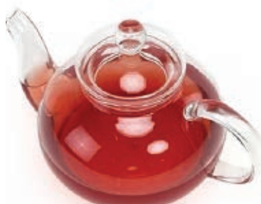
Glass Teapot Medium 27oz. 80072