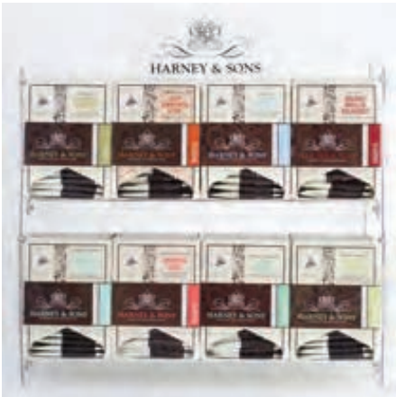
91007 Wrapped Sachet Lucite Rack