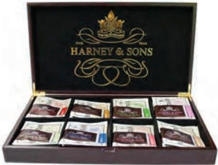
Wrapped Sachet Wooden Chest 00535 Wooden 00593 Linen