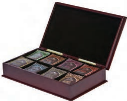
00515 Teabag Wooden Tea Chest