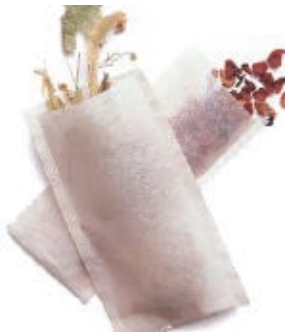
Finum Paper Filters Large (2,400 per case) 06140 XLarge (2,100 per case) 06150