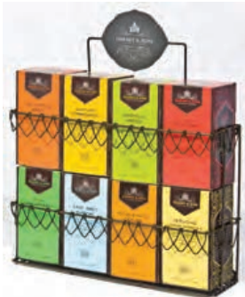
91004 Premium Teabag Wire Rack