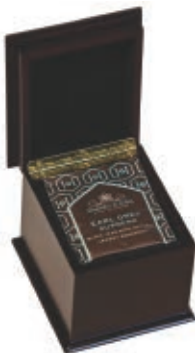
00517 Teabag Wooden Tea Chest 1 Slot 90125 Wrapped Sachet Wooden Chest