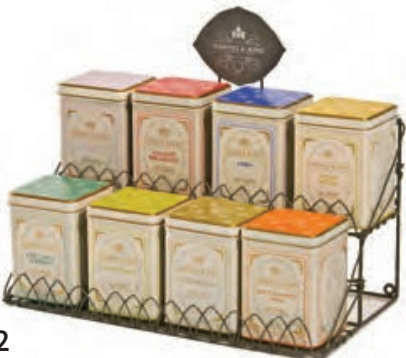
91005 Tin Wire Rack