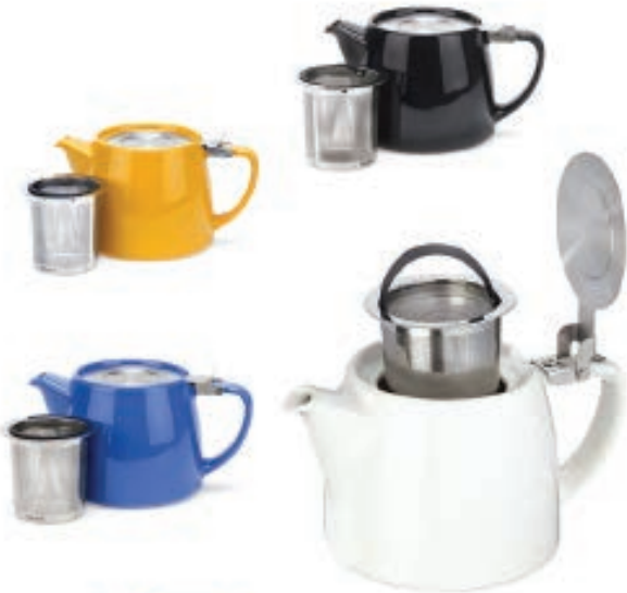
Stump 16oz. Teapot Black 00547 Mandarin 00700 Blue 00666 Red 0618 White 00598